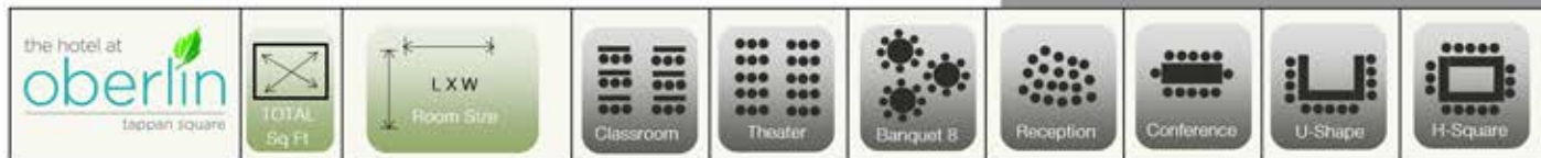
Maximum number of people per seating style